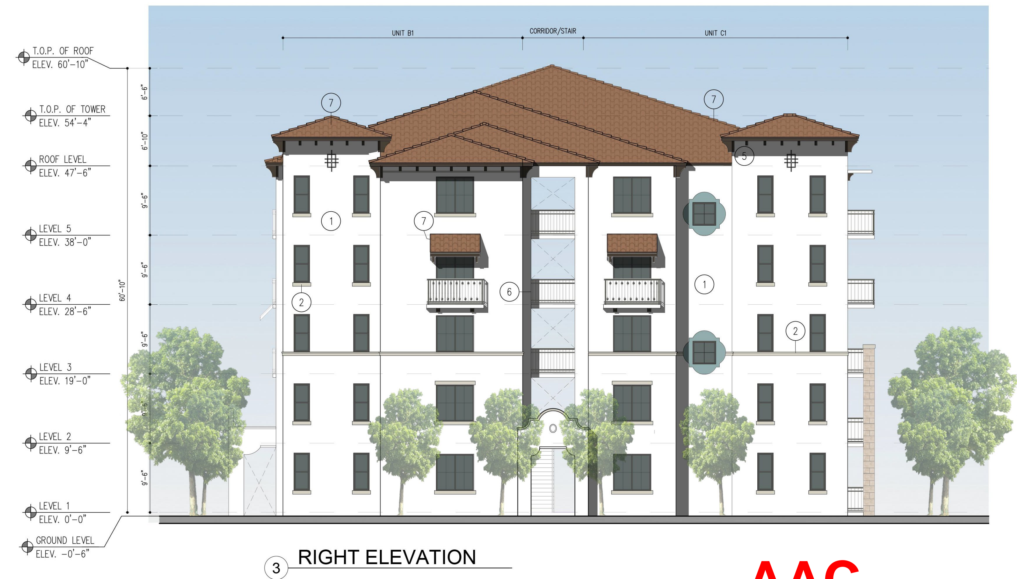
3 RIGHT ELEVATION